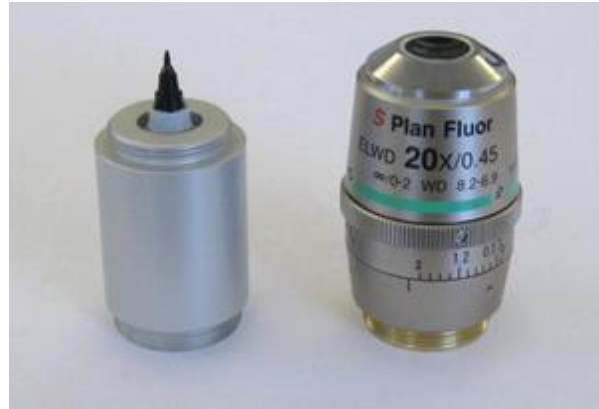
Left Image: IncuCyte Tray 25 with one holder for 35mm dishes. Right Image: IncuCyte Marking Tool side by side with a 20x objective.